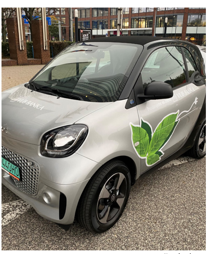
New electric cars