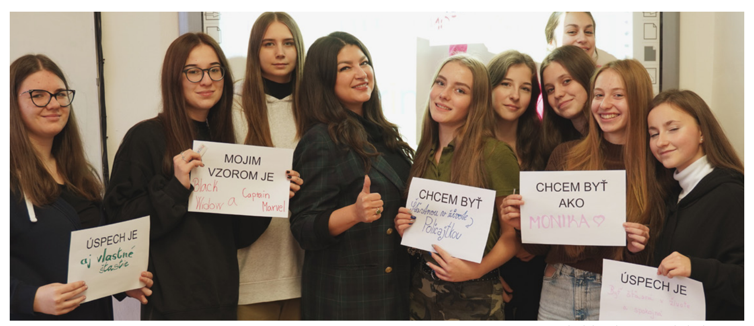
Lecture at a primary school about the Inspiring Girls Slovakia project

Even little girls have big dreams, they dream big because they can. In today's world, they have many possibilities and we believe they can aim high. That's why we have become the initiator, sponsor and main partner of the Inspiring Girls Slovakia project, which inspires young girls to believe in themselves when choosing a career in the future.