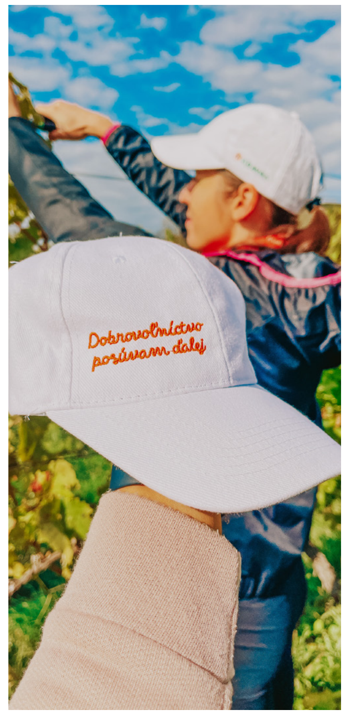
The third year of the Week of Volunteering initiative