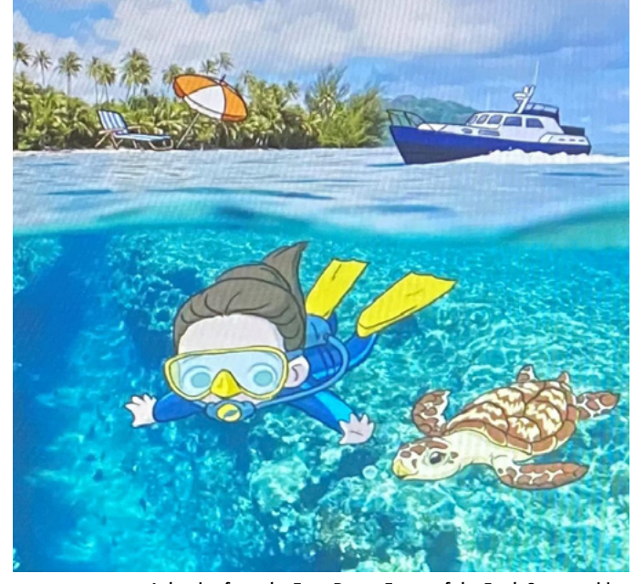
A drawing from the For a Better Future of the Earth 2 competition

The excellent programme, which has already reached thousands of pupils and us at VUB Bank during its pilot year, focused last school year on the importance of water for humanity, animals