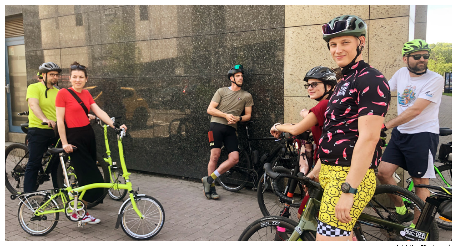
Iniciative Bike to work