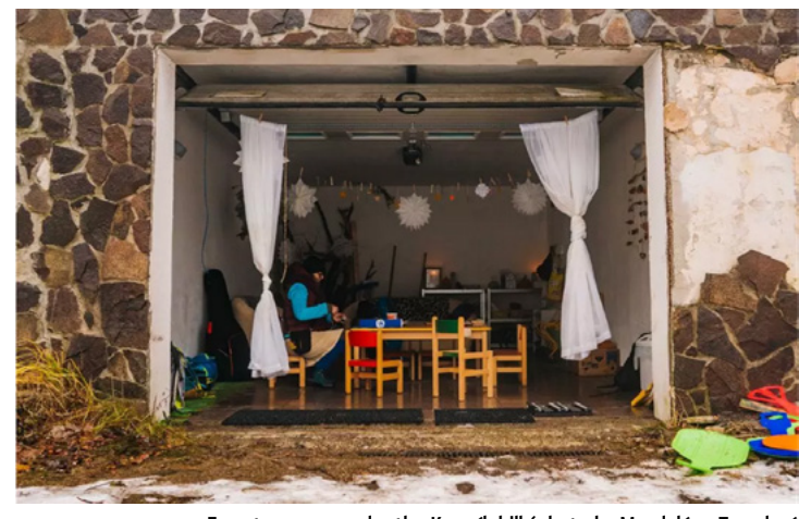
Forest nursery under the Kamzík hill