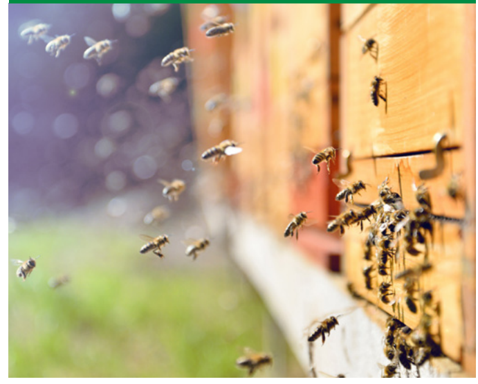
WWF

We also helped to raise additional financial support for WWF's work for bees and other pollinators in Slovakia through our own campaign. We decided to spread the call for donations through WWF's donation system in connection with the idea of an original font made of leftover beeswax, which we produced with our creative agency TRIAD. We have converted the unique typography into an electronic version for use in text editors. And to everyone who decided to contribute any amount to the WWF Slovakia system via the campaign website www.fontprevcely.sk, we sent this font as a joint thank you on behalf of our bees. The funds raised by this "fontraising" were attached to a project of planting fruit trees and shrubs, planting flowering meadows in at least three different locations in Slovakia.