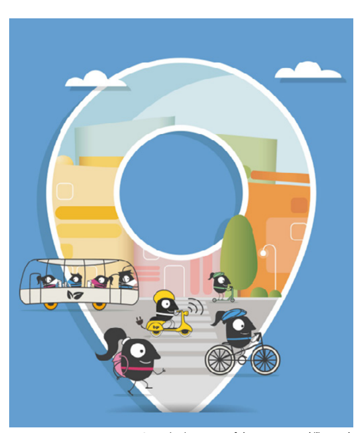
Campaign in support of the European Mobility Week

As a bank, one of the ways in which we want to reduce our collective carbon footprint is to increasingly incentivise ourselves to drive green to and from work. That's why we do everything we can to ensure that our colleagues have good conditions and maximum convenience for using modes of transport other than their own cars - not just public transport, but especially bicycles and scooters. To this end, we are building a space at the bank's headquarters where you can safely store your transport means, but also take a shower or change into sports clothes. The bike-sharing system, which colleagues can borrow directly from the VUB headquarters, has also proved its worth. In fact, the promotion of active movement and community sports spirit is a strong