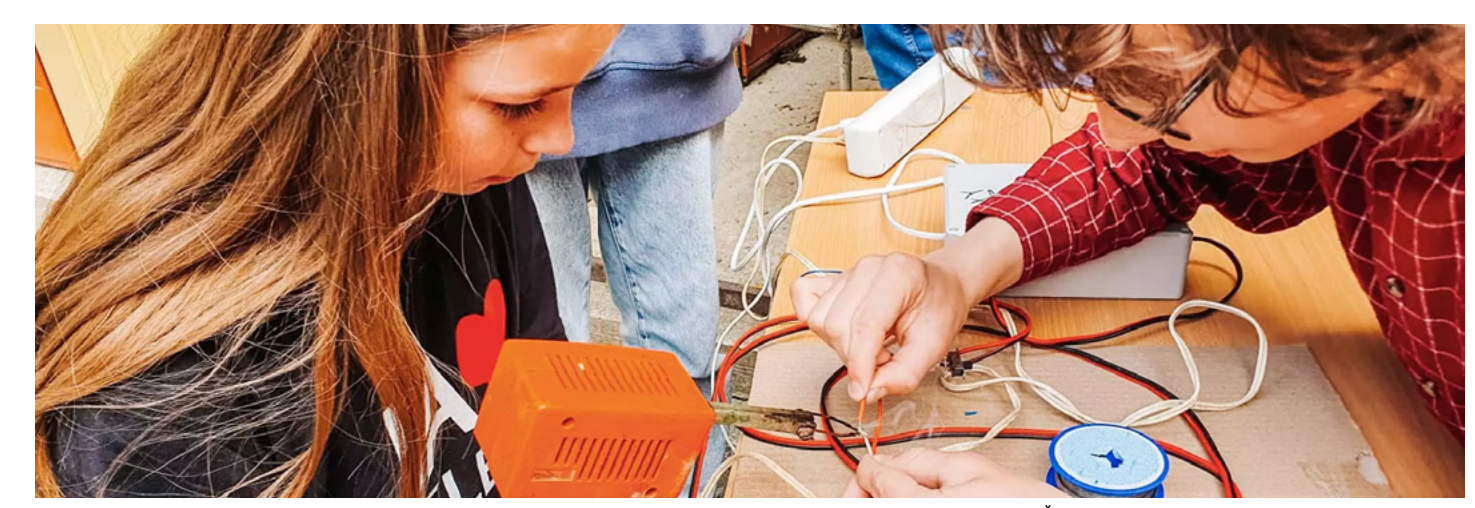
Živica, a non-profit NGO, also received an Envirogrant

In recent years, the topic of environmental responsibility in construction and architecture has become so popular that it is also at the forefront of public awards in this sector. The most well-known initiative of this kind in Slovakia, the CE ZA AR award, whose announcer is the Slovak Chamber of Architects and which draws attention to the social value of buildings and works, has in its recent years joined the global movement of emphasising green principles in architecture. As a bank that stands for real deeds and buildings contributing to a better quality of life and improving the state of the environment, last year we again signed up to this initiative and continued as a general partner of the CE ZA AR Award.