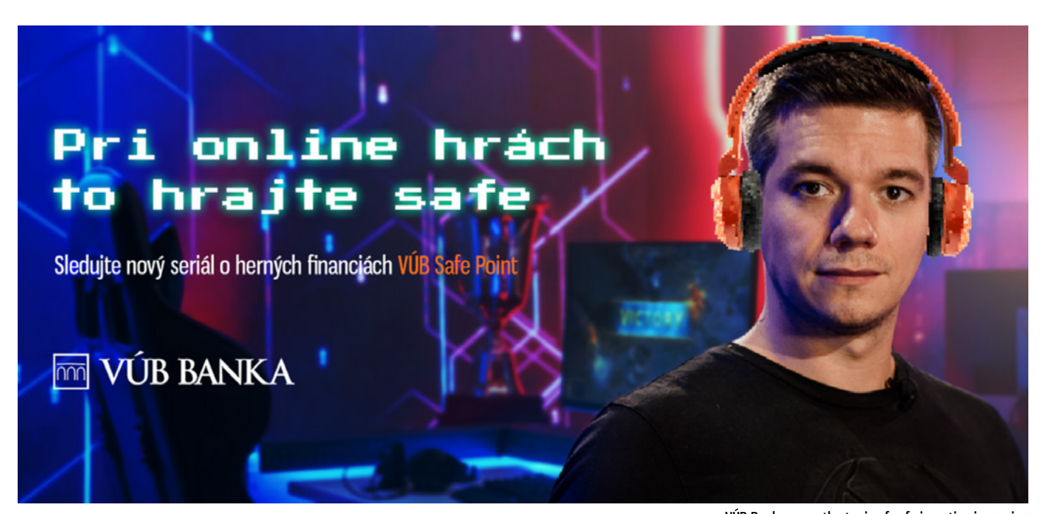
VÚB Bank covers the topic of safe investing in gaming