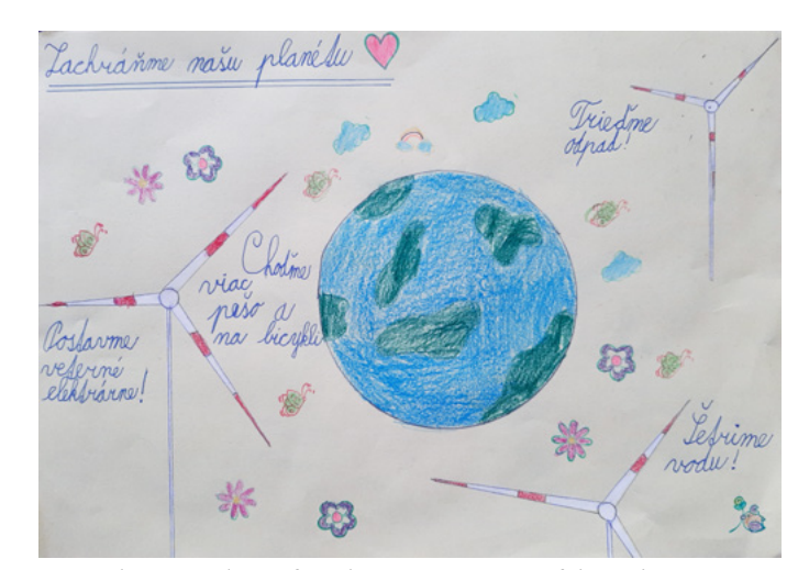
The winning drawing from the For a Better Future of the Earth 2 competition

As the main partner of the initiative, we were also involved in the co-organisation of the creative point after the programme. The children were able to illustrate the knowledge they had gained about water conservation in nature with their drawings and take part in the accompanying competition. The authors of the three best entries - pupils from primary schools in Skalica, Suchá nad Parnou and Veľký Krtíš - were awarded special prizes in June, and the first place winner also won a trip to Bratislava for her