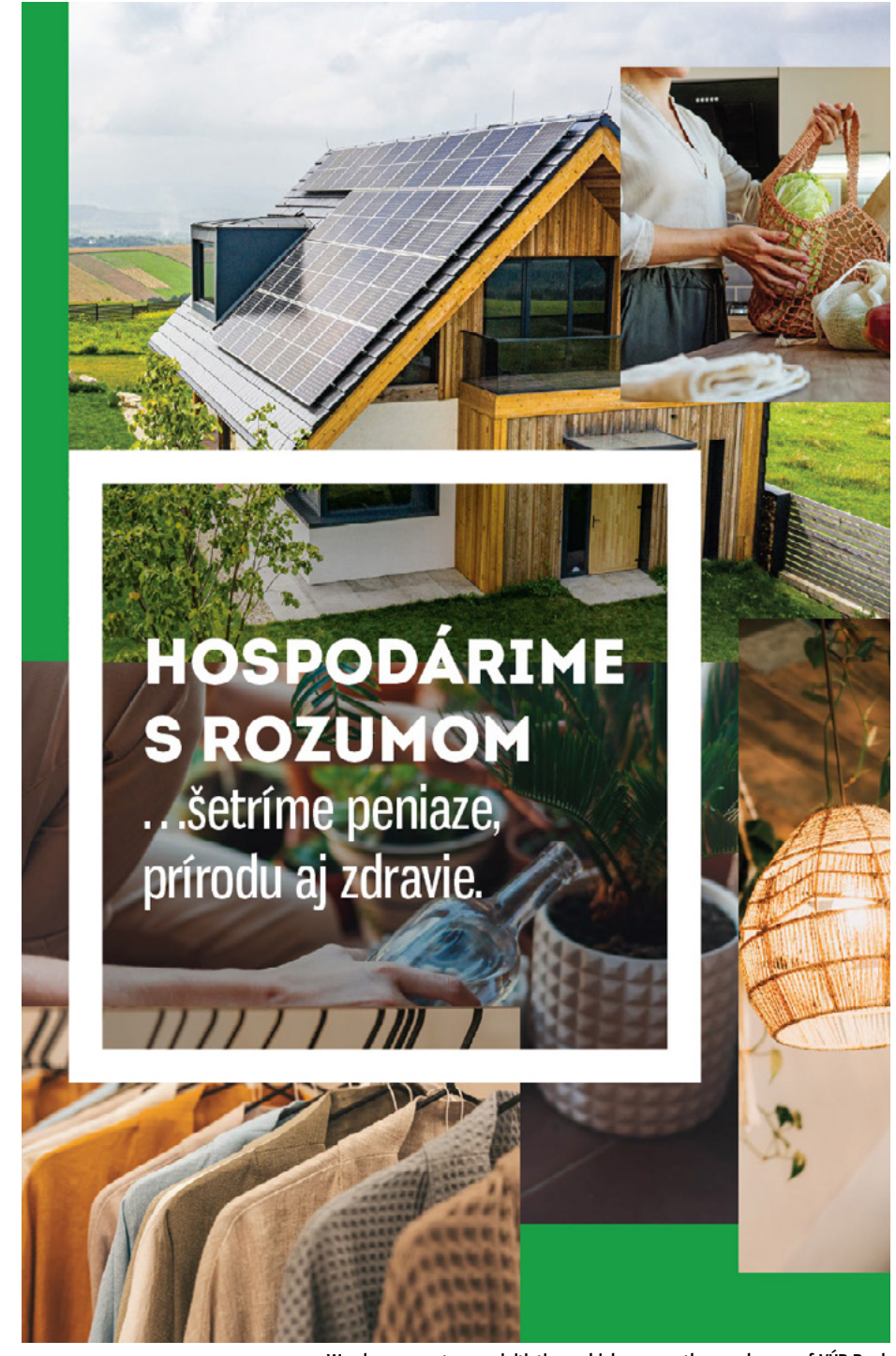
We also support green initiatives which engage the employees of VÚB Bank

We returned to the unique ecological Sut'opark in the exterior of the former secondary chemical school in Bratislava on 31 July for an event organized by Nová Cvernovka in cooperation with the Climate Needs You initiative. It brought together hundreds of people who want to be ambassadors of enviro education and lifestyle. We are glad that such green activities also took place during the summer series of events Summer under the Palm, which we supported with our foundation as a partner of Nová Cvernovka. The program included a very beneficial walk in the community garden that covered making and using homemade compost. This has huge benefits not only for a richer and healthier harvest, but especially for the overall improvement of soil quality, which is of huge importance in the fight against climate change.