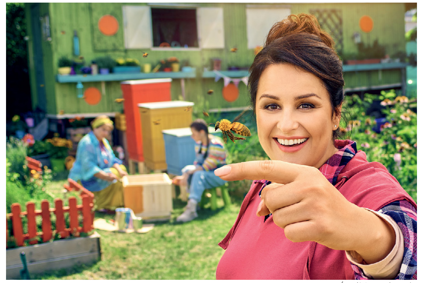
VÚB Bank's Green Funds campaign

In August, we adopted an internal directive on green procurement. We are thus starting to look again at our supplier selection process to ensure that we only use inputs, energy-efficient media, equipment and services for our operations and activities that have the least impact on the planet, conserve natural resources and are socially sound and sustainable. By doing so, we are also engaging our business partners and suppliers so that together we can transform Slovakia's economy in line with the principles of sustainability.