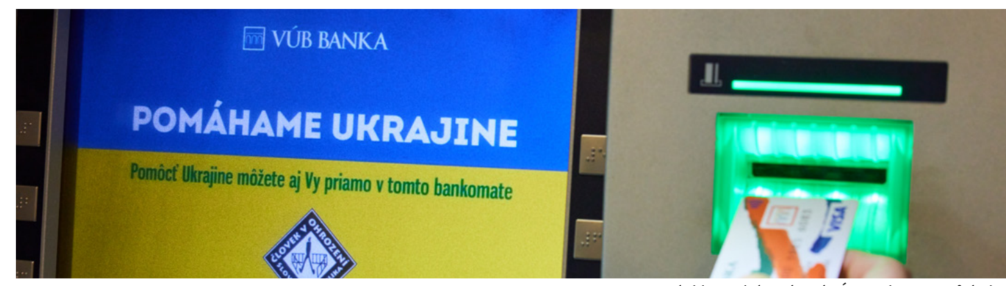
Fundraising carried out through VÚB ATMs in support of Ukraine

Our bank's clients could easily have been involved in the collection to support the work of People in Peril. All they had to do was to go to the nearest VUB ATM and send a pre-selected amount of money