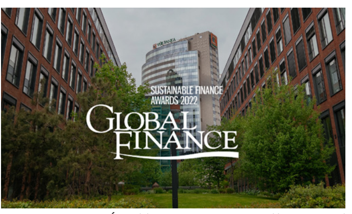
VÚB Bank has won a prestigious Sustainable Finance Award

Our mission to actively participate in the professional dialogue on real solutions for reducing the carbon footprint of buildings and entire local self-municipalities can also be seen in our partnership with Manifest 2020 . In this context, we are delighted to have been able to sit down with experts from Nová Cvernovka, with whom we have a long-standing friendship through our foundation, alongside other leading figures in the field of architecture. How to transform cities and regions into carbon neutral ones? How to translate the principles of the New European Bauhaus into life in Slovakia? How to move forward the green renovation of historic and public buildings? These topics were also discussed in the expert roundtables and awareness-raising campaigns under the hanner of Manifest 2020 in 2022.