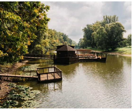
Water mill in Kolárovo