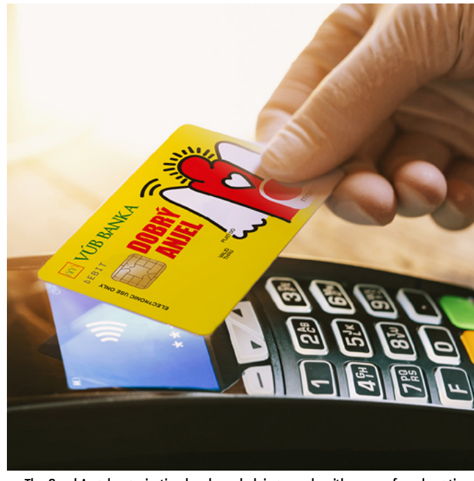
The Good Angel organization has been helping people with cancer for a long time \,

The VUB Foundation also supported the activities of the Paraswimming without Limits Centre in Bratislava with its grant. Talented swimmers with disabilities can thus be provided with the rent of the swimming lane, the activities of the coach and can partially cover the expenses for their training. The story of the centre and the achievements of the young paraswimmers is also presented in <u>our article</u> in the Srdcovky magazine.