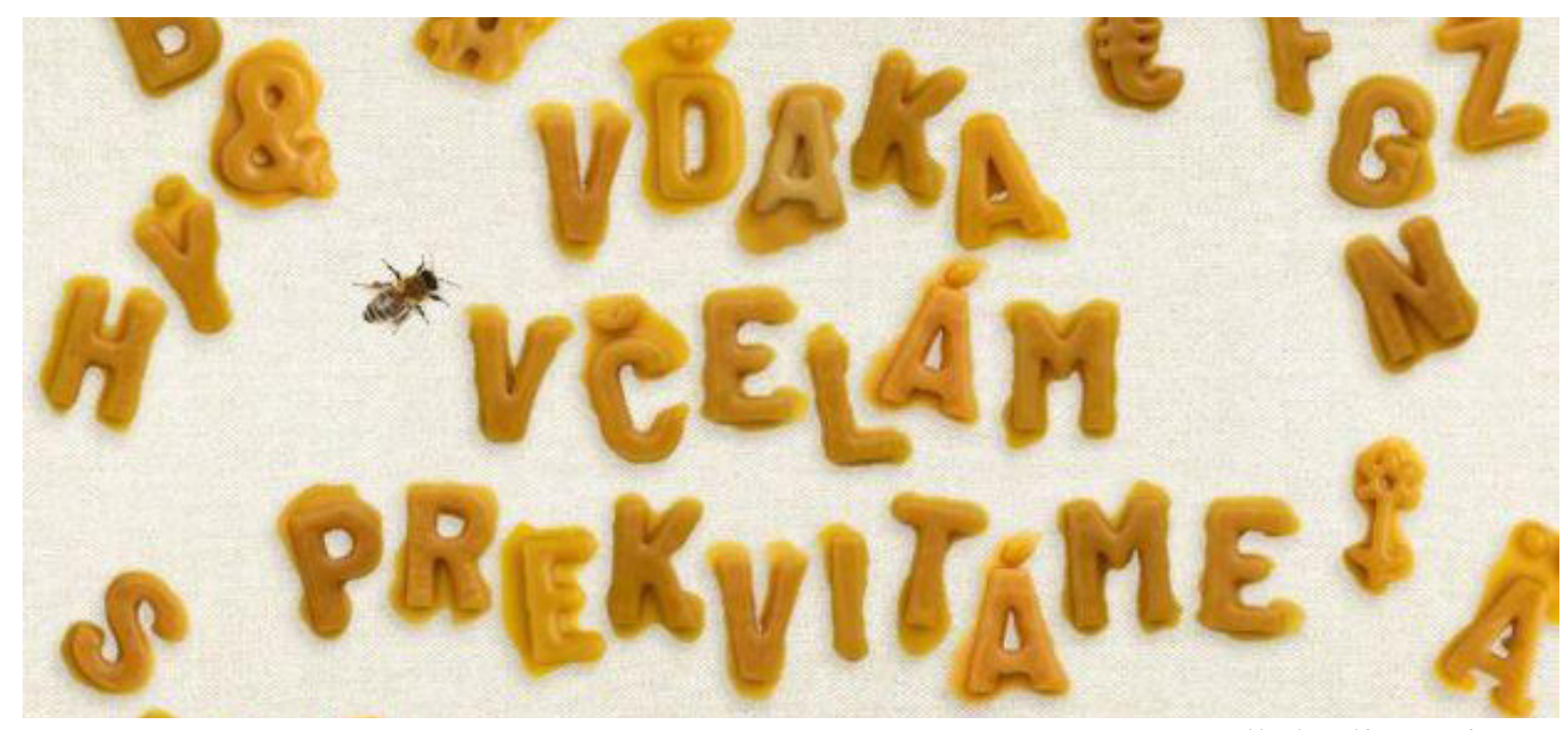
World Wide Fund for Nature - fontraising