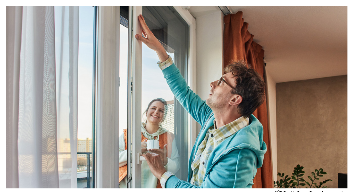
VÚB Bank's Green Financing campaign

For clients who have decided to build or reconstruct in accordance with the low-energy standard, we were the first bank in Slovakia to offer a discounted Green Mortgage in 2021. Last year, we followed up on this step and the <u>Green Loan</u> became part of our permanent portfolio, which has a wide range of uses in the home - to finance technologies that increase the energy efficiency of the property or bring eco-friendly innovations that reduce the carbon footprint to the house or apartment - for example, solar panels, a biomass boiler, a heat pump, replacement windows, insulation of the house with high-quality insulation, a green roof, a rainwater tank. Last but not least, green means of transport - electric cars - can also be financed in this way.