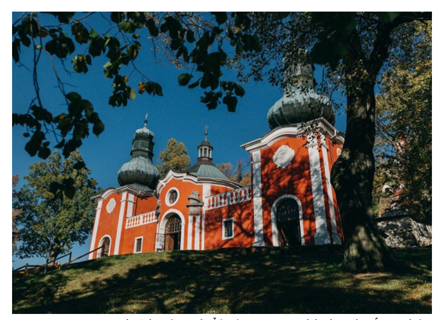
The Calvary in Banská Štiavnica was renovated thanks to the VÚB Foundation

The link between art, VUB Bank and the VUB Foundation has long been strong. For many years we have helped to gradually bring back to life one of the greatest icons of cultural heritage in Slovakia - the Calvary in Banská Štiavnica. For 13 years we have been supporting the preservation of smaller historical gems through the Treasures of Slovakia initiative. And we help not only to protect art, but also to develop it. Our Painting Competition, aimed at raising the profile of young artistic talent, which we have organised for the 17th time this year, gives an idea of this.