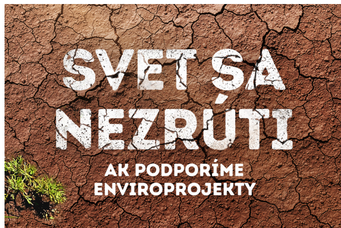
Photo: VUB Foundation supporting the Environmental Projects already for the second time

mus, n.o. (Pusté Úľany, Galanta district), OZ SaUvedom (Trnava), Aevis n.o. (Poloniny National Park) and Cyklokoalícia (Bratislava).