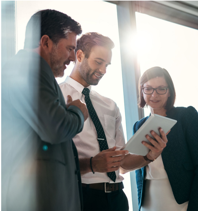
Photo: VUB Bank regularly updates various internal policies to protect its employees

VUB Bank provides for protection of its clients and the bank itself also with its anti-money laundering or anti-terrorism system, in the form of detection of unusual business transactions . In no case do we want to even unknowingly or indirectly support these negative phenomena by enabling financial flows through our products, services or in any connection with the bank. Strict internal rules in this regard also include our non-armament policy, policy on relations with political parties or relations with clients, and transactions from / to high-risk countries.