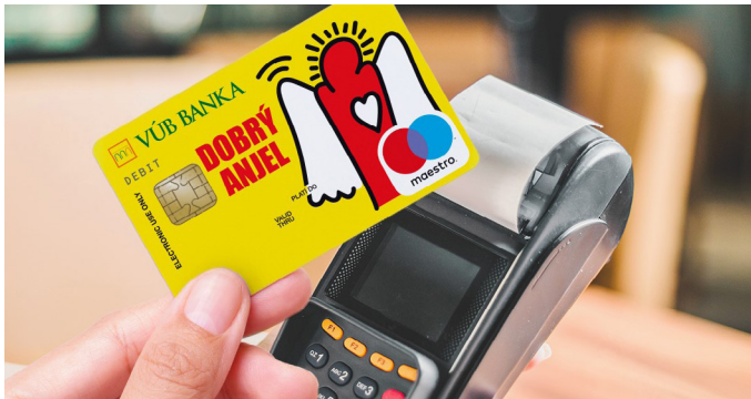
Photo: VUB Bank continues to support sick children thanks to the Good Angel organization

in need, we have had the longest and strongest alliance with this organization. We are the first and so far the only bank to create a major source of financial support through Maestro Dobrý anjel debit card payments. At the same time, it does not cost the clients themselves anything at all, and we pay the amount from all monthly card payments from the bank's own resources. This currently represents 0.2% of the payments made, which means that with a total of more than 65,000 angel cards, in 2021 VUB Bank sent to the families of cancer patients as much as EUR 350,000.