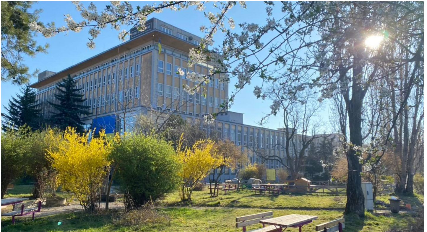
A view of the Nová Cvernovka building

combines modern technology, architecture, art and aesthetics with the values of sustainable development. As a green bank in the coming years within the team of signatories and professional organizations associated under the 2020 Manifesto, we want to draw inspiration and simultaneously help with solutions that will bring the idea of the New European Bauhaus into reality by financing the sustainable and aesthetic renovation of buildings in cities around Slovakia.