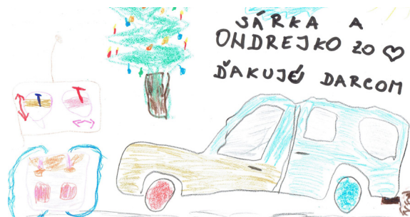
Photo: A letter for Baby Jesus with a Christmas wish connected to Christmas donation

of a specific family. For the second time, the bank's employees also took part in the Christmas donation and bought the children, whose parents found themselves in an uneasy life situation, what they most wanted to find under the Christmas tree. Thanks to them, children from 60 families received the coveted toys, building sets, board games, books, sports equipment, musical instruments, clothes and much more. They got everything they asked for in a letter they wrote to Baby Jesus.