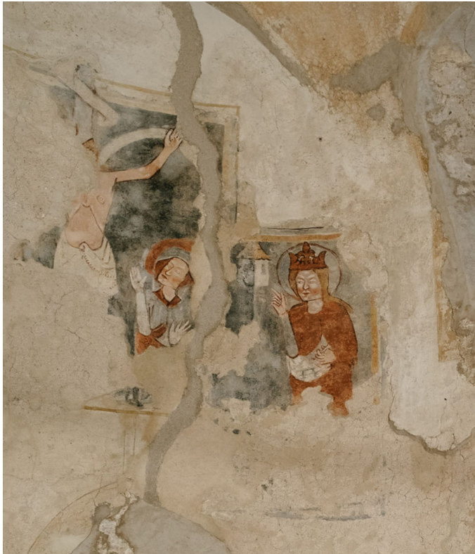
Photo: VUB Foundation contributed to restoration of recently discovered Gothic frescoes at Uhrovec Castle

Our voting competition Treasures of Slovakia , focused on the restoration of Slovakia's cultural heritage, is already a well-known initiative to the public. VUB Foundation has been contributing to raising awareness of the condition of historical monuments in our territory and