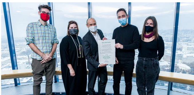
Photo: Signing of the Green Manifesto at VUB Bank

As a bank, we have been striving to be active in the field of green economy and renewable energy sources for several years now. Since the first announcement of support for alternative production sources, we had a strategy in this type of financing in place. Over the past decade, we provided loans worth almost EUR 5 million for implementing green technologies in practice. Nearly half of them were construction mortgages. More than 20% of loans went to acquisition of energetically passive real estates. The share of our financing in the field of renewable sources, especially photovoltaic power plants, is the highest in the market. In the corporate segment, we are number one with a market share of approximately 20%.