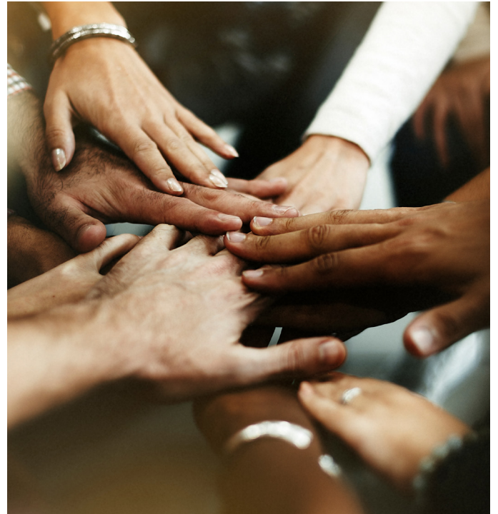
Photo: One of the topics that VUB Bank deals with is also Diversity and Inclusion

VUB Bank openly declares support to promoting inclusion and diversity, and therefore on Diversity Day, which in 2021 fell on 31 May, we joined the nationwide Diversity Charter Slovakia initiative (under the auspices of the European Diversity Charter Platform) and became its ambassador. By signing it, we confirmed our commitment to create an inclusive, fair and trust-based working environment for the bank's employees. This topic is not new to us at VUB, we have had the principles of diversity and inclusion in our DNA also thanks to our parent group Intesa Sanpaolo.