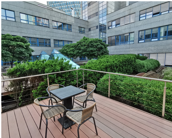
Photo: The newly renovated atrium at VUB Bank's Head Office in Bratislava

A part of the environmental management of human resources at VUB is also the support of ecological transport of employees . Bicycle rental is permanently operational at VUB's Head Office in Bratislava. For colleagues around Slovakia, we installed a total of 85 bicycle stands in front of the