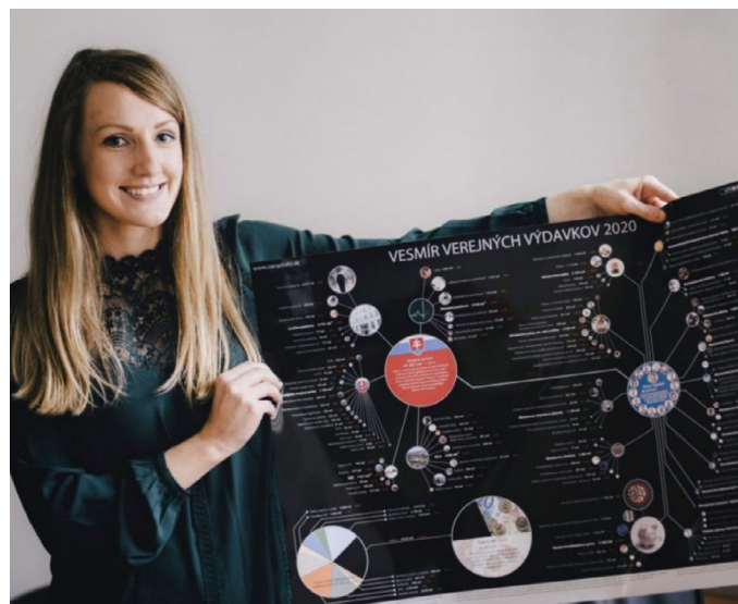
Photo: Internal educational activities at VUB on the topic of financial education

Financial literacy is increasing also thanks to the colleagues from the bank, who give lectures on this topic at primary and secondary schools, and at universities specialized in economics and finance. For those who need advice or get quickly oriented in the world of finance, there is also our contact center, which is available to clients 24 hours a day.