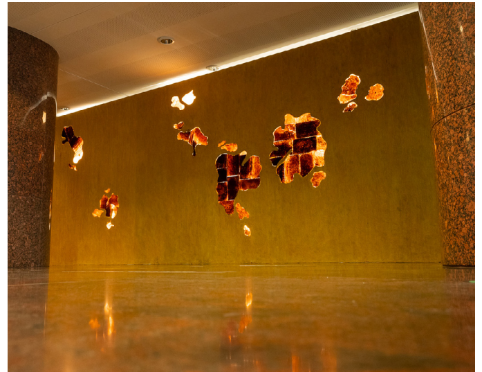
Photo: Jaroslav Kyš created a unique artwork of bee honeycombs and wax in the lobby of VUB Bank's Head Office in Bratislava

Thanks to the increased digitization and long-term effort to switch to sending bank statements and correspondence electronically, our total paper consumption decreased by 72% between 2021 and 2016 . Reducing the number of physically sent postal consignments to our clients in connection with accounts and savings has been a stable trend in our bank. In 2021, we as a bank managed to achieve a 20 percent decrease compared to the previous year.