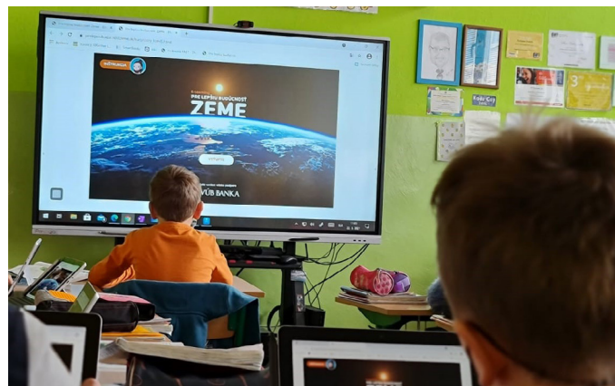
Photo: Education "For a Better Future of the Earth" running in schools ;

The ongoing pandemic and the development of distance learning gave rise to a variety of engaging online courses designed for playful education of children. One of them included the idea of the Eduvision agency, which, in cooperation with climate and environmental experts from the civic association OZ EUROARCH , launched an awareness-raising campaign among the primary school pupils on highly pressing topics. The "For a Better Future of the Earth" project educates about nature conservation, introduces the topic of climate crisis and explains how it affects our lives and how each of us can help our planet. At VUB Bank, we did not hesitate for a moment and supported this idea.