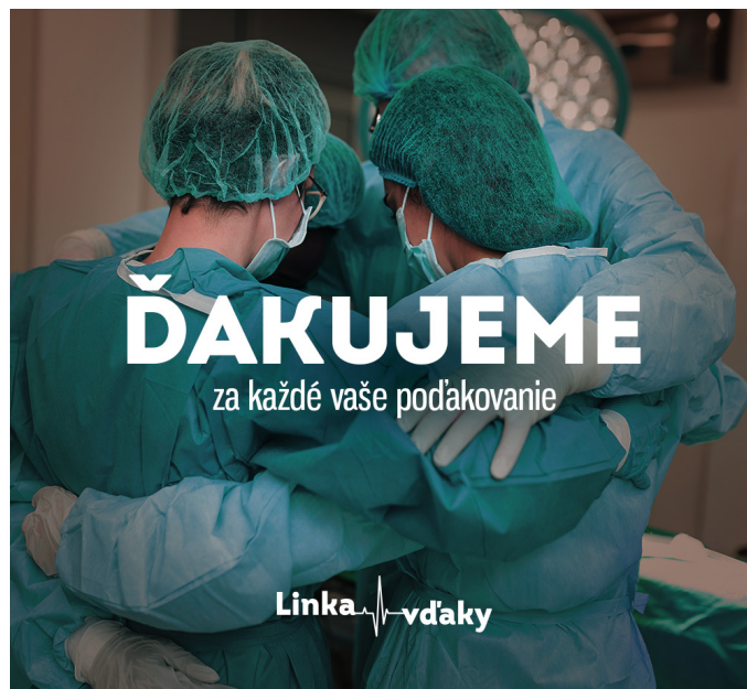
Photo: Thanksgiving Line is another initiative of VUB Bank for supporting healthcare staff

Also in 2021, we stood by the #KtoPomozeSlovensko initiative and participated in the activities of one of the largest civic initiatives aimed at helping the Slovak healthcare system since the very outbreak of the pandemic. VUB Bank, in cooperation with well-known faces and media partners, helped create a TV spot on behalf of the initiative, which aimed to send a thank-you and encouraging message to Slovak healthcare staff.