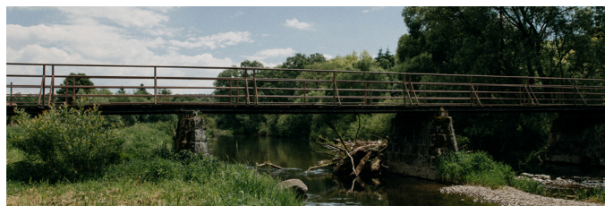
Photo: Slatinka Association won the Atlas award in the Biodiversity category