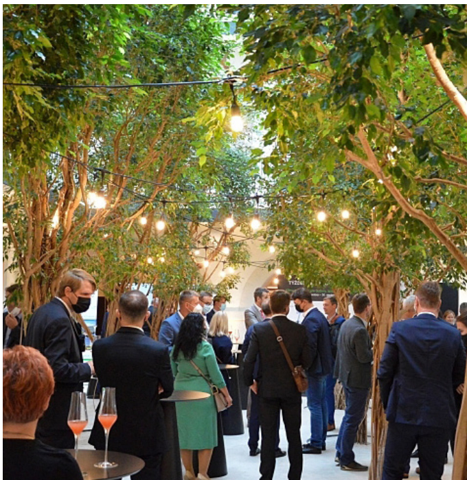
Photo: VUB Bank became the general partner of Green Buildings' Week

only three percent of their total number in Slovakia. Similar situation applies also to the amount of funding allocated in comparison with the total investments needed in the buildings sector.