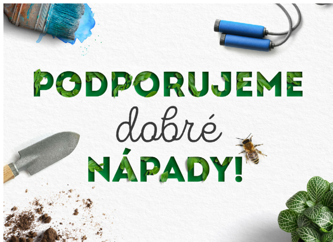
Photo: VUB Foundation has been supporting an employee grant program called We Support Good Ideas already for 16 years!

dings, on which they want to work together in their communities. Up to 145 civic associations, schools and municipalities enrolled in the 15th annual employee grant program of VUB Foundation entitled "Help Your Community". People working in various positions in VUB Bank across Slovakia participate in the preparation or implementation phase of projects they submitted.