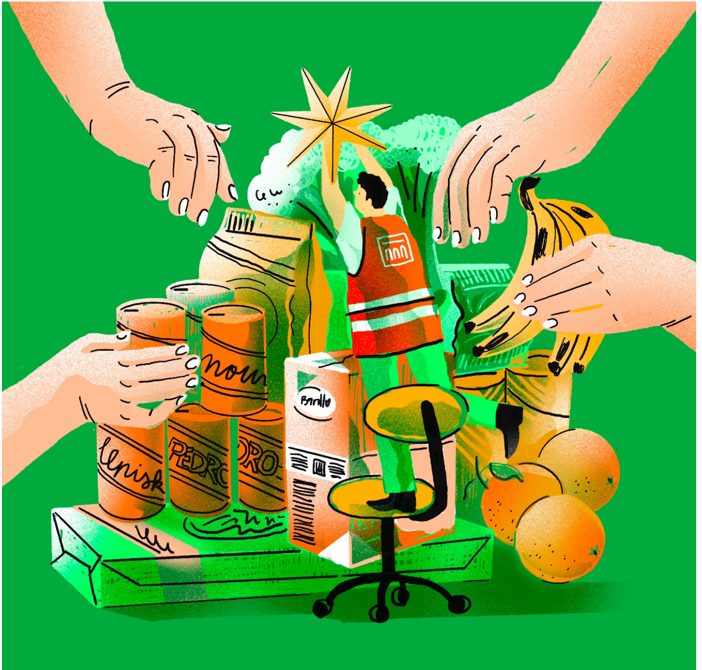
Photo: VUB Bank employees are regularly involved in volunteering and donation initiatives