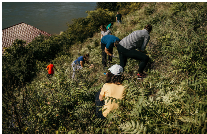
Photo: VUB Bank employees helping to remove brushwood during the Volunteering Week

in Trenčín and the TANAP National Park. Thanks to 63 colleagues across Slovakia, we managed for example to clean up sidewalks around the Tatra mountain lakes, unburden another piece of nature within the protected landscape area near the Danube River below the Devín Castle, revitalize a cherry orchard near the Trenčín Castle and also collect more than 100 kg of rubbish in a protected valley near Banská Bystrica, where rare springs and a source of drinking water are located.