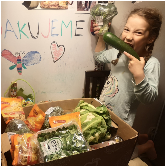
Photo: Easter donation helped many families during the pandemic crisis