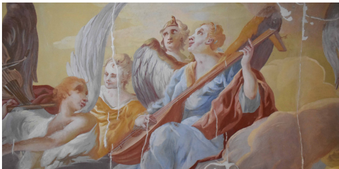
Photo: VUB Foundation cares about protecting and preserving our cultural treasures