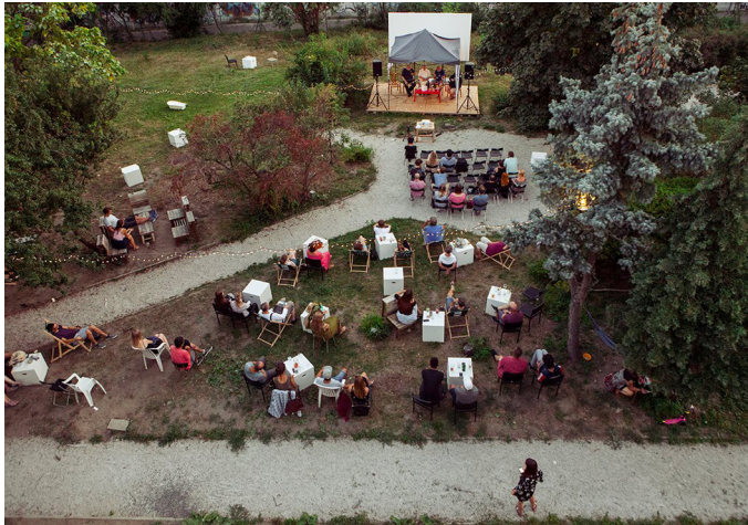
Photo: Thanks to the support of VUB Foundation, a park in Nová Cvernovka was created from rubble.

The garden at Bratislava's Calvary was once the property of the successful Prüger family, who had a villa built here before World War II. However, after the war they left Bratislava and over time, the land became the property of the town. Meanwhile, more than 70 years passed, during which the garden became desolate and a waste depot. However, all this is the past today and the PrügerWallner Garden begins to write its new story. The unique natural garden is now fully available to all - open for walks, picnics or games or experiential learning for children. Opening hours and program are published at the www.prugerka.sk website.nájdete na stránke www.prugerka.sk .